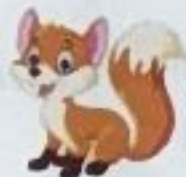
as in fox