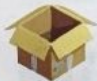
as in box