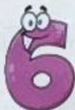
as in six